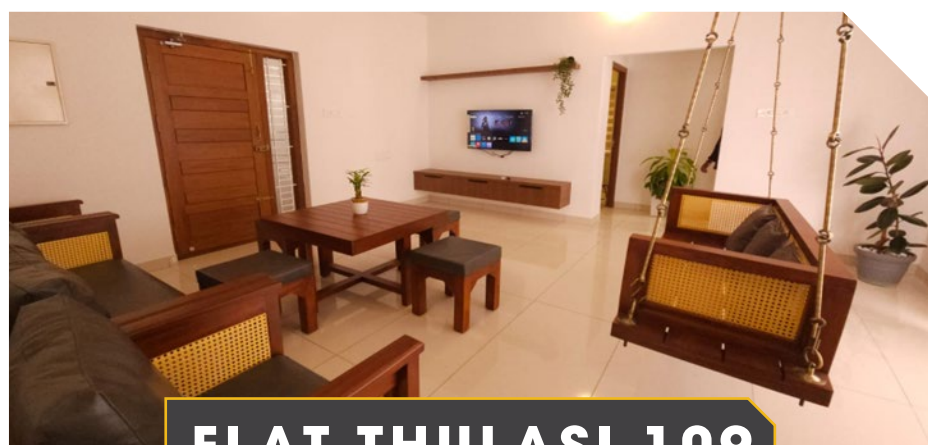
FLAT THULASI 109