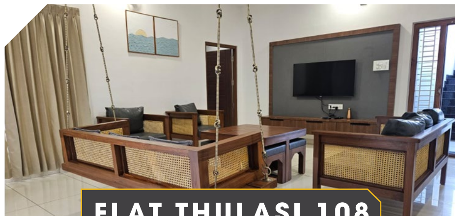
FLAT THULASI 108

Our textured art in the living area, adds contemporary touch and enhance the ambience.